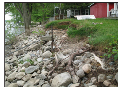
Swanton camp's eroded shoreline

Applications are available NOW: www.nrpcvt.com/shoreline.html or (802) 524-5958