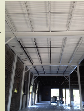
Cleanup design and implementation is integrated with redevelopment.

Application Process. Applicants apply for a loan, grant, or a combination to the NRBP Steering Committee. There is a 2 part application process. Part A determines applicant and site eligibility. Part B determines project viability and conformance with the program's goals and objectives. Part B includes review of cleanup, redevelopment and business plans, and for loan applications, credit analysis.