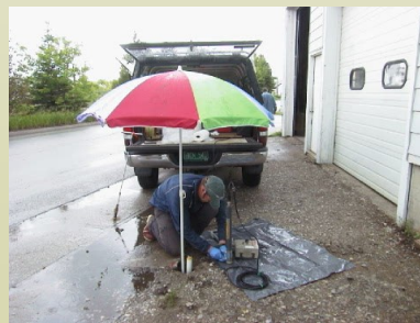
Testing is designed so as not to interrupt normal business operations.

Once Accepted, Then What? If a site is accepted into the program, NRPC hires a consultant to complete the environmental assessment. The Commission provides copies of both draft and final documents to owners and prospective developers. Owners can then decide whether to proceed with further assessment or corrective action planning.