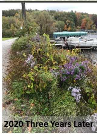
2020 Three Years Later